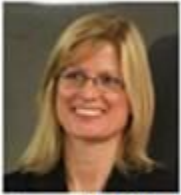
Council Dist 2