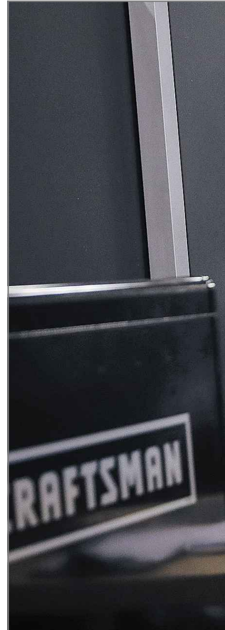
A machine operator works at Lord Corp. in Erie, Pa. Manufacturing companies added jobs last month.